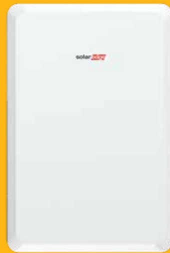
SolarEdge Energy Bank

Up to 3 batteries can operate in parallel per inverter. As more products, like electric vehicles, become linked to home energy generation and storage devices, this extra capacity is an excellent way to future-proof your home.